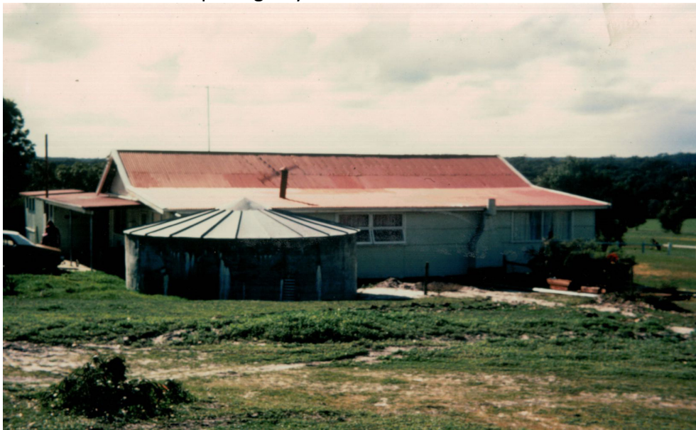
1976 Clubhouse on Opening Day