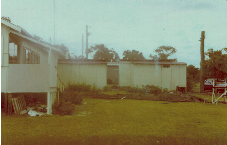
1979 Preparing the foundations for the new toilet block