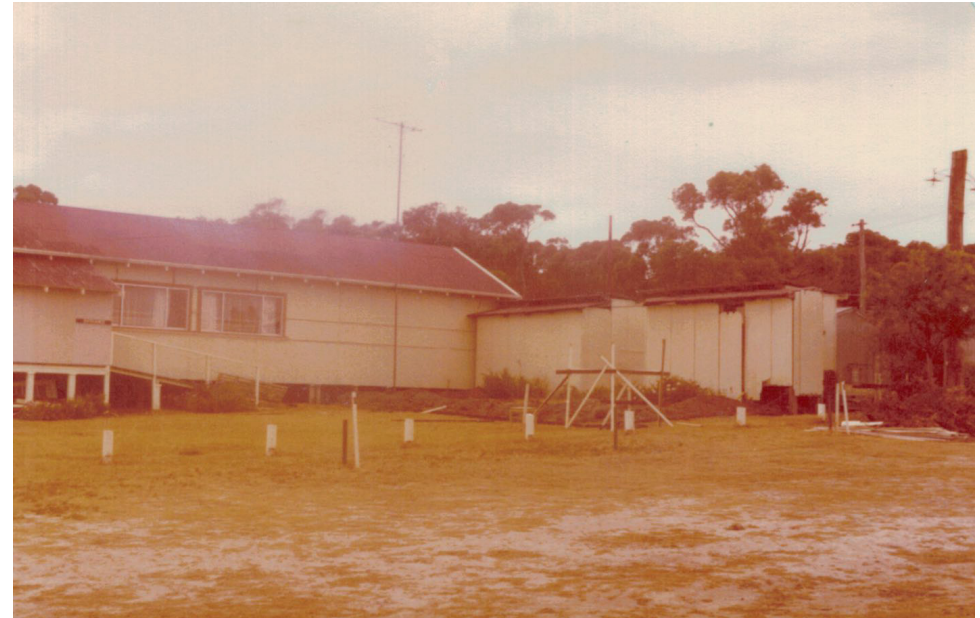
1979 Preparing the foundations for the new toilet block