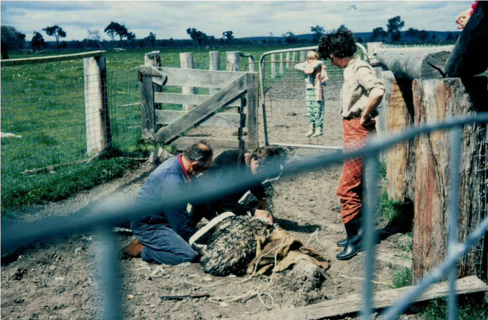
1972 Ray and Smiler emu wrestling on a property off Nannup Road. Brought back to breed but ran away as soon as released on the course