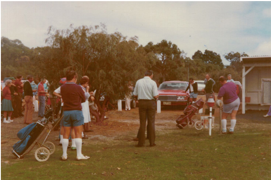
1978 Opening Day speeches