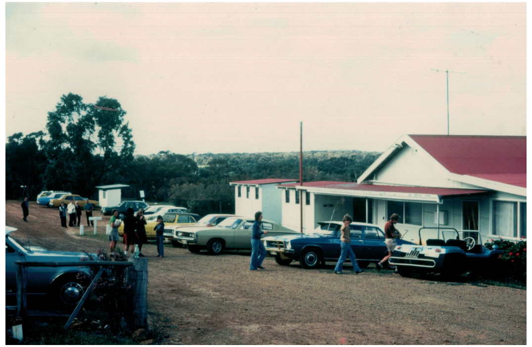
1976 Clubhouse on Opening Day