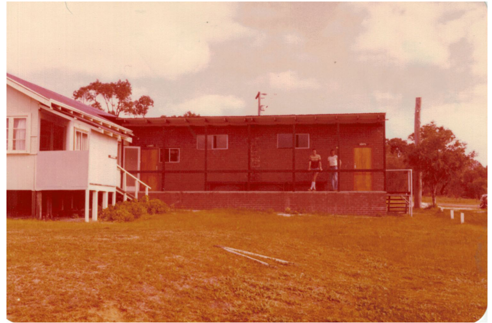
1979 New toilet block finished.