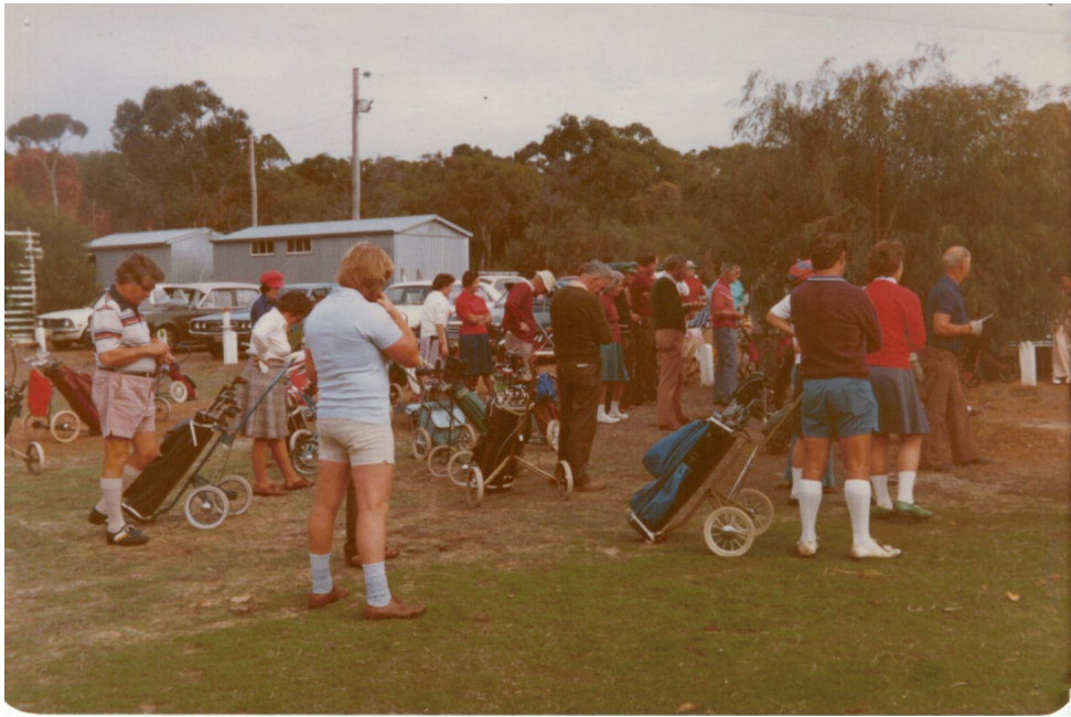
1979 Opening Day