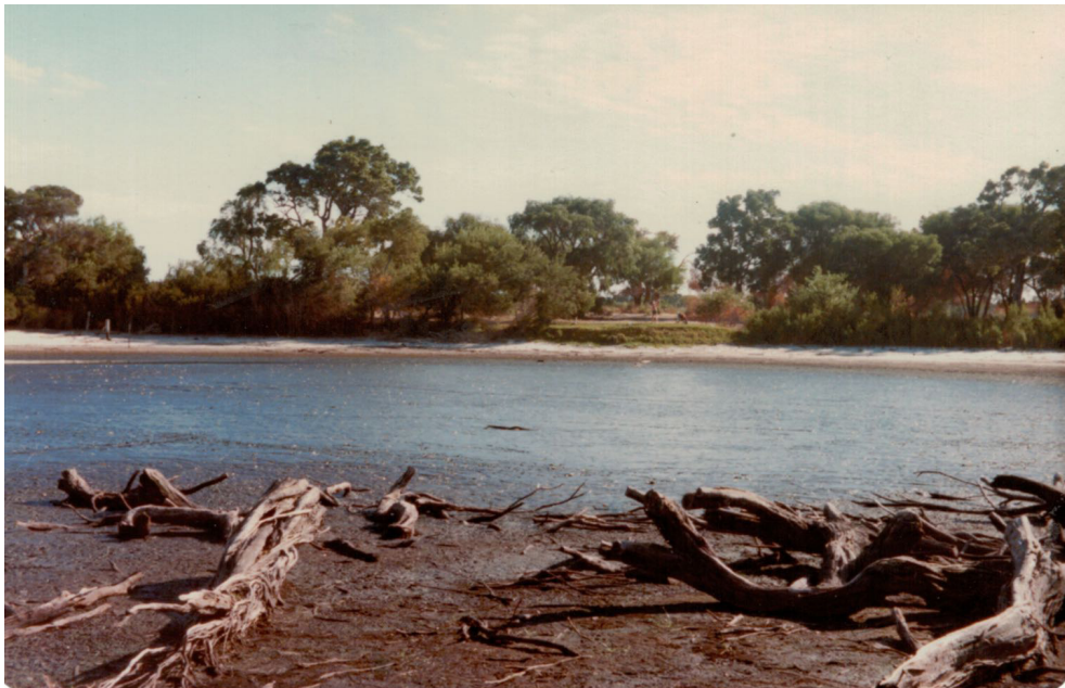
1977 Driest lake had been, no water just reflection off mud. Taken from 11 th tee