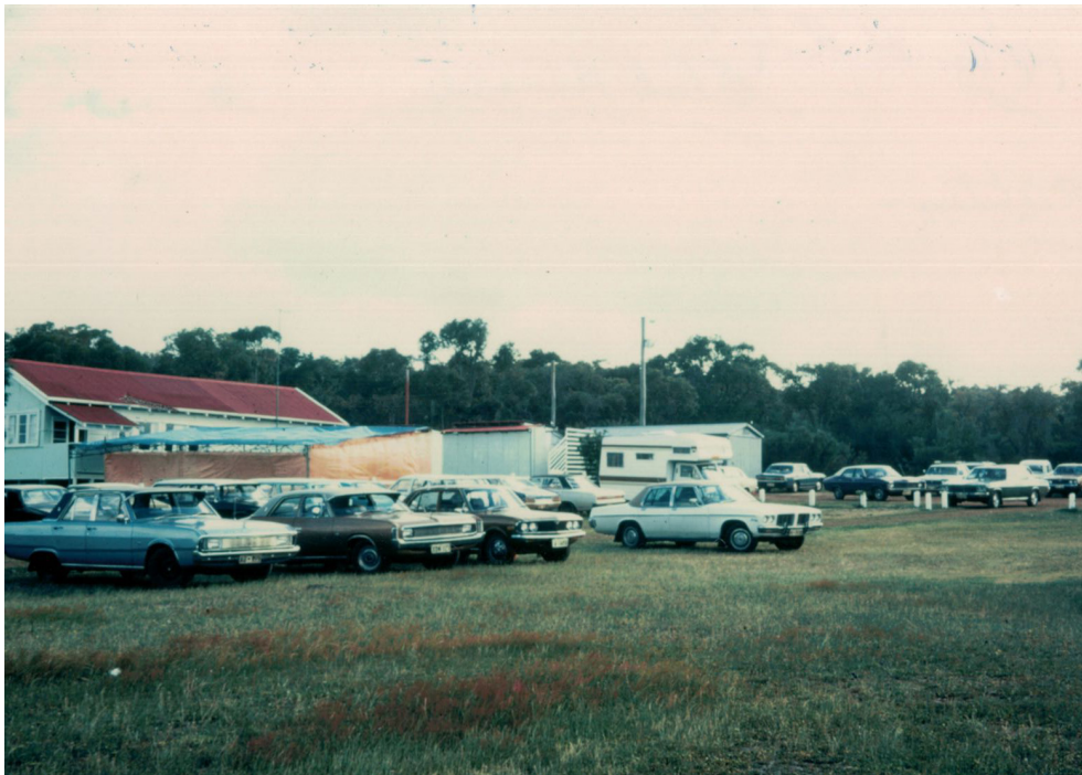
1976 Clubhouse on Opening Day