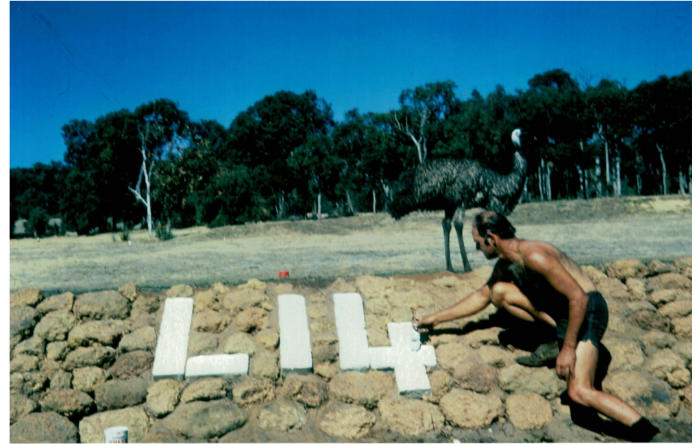
1974 Ray Atcheson painting the markers on ladies 14th tee with emu in background