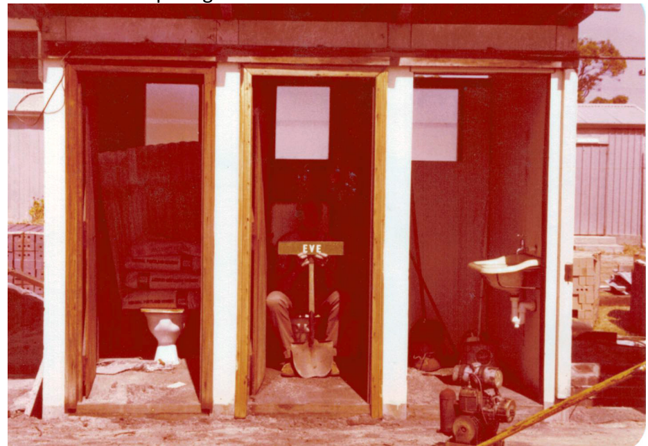
1979 Doug Phillip-Jones sitting on toilet - old toilet in background